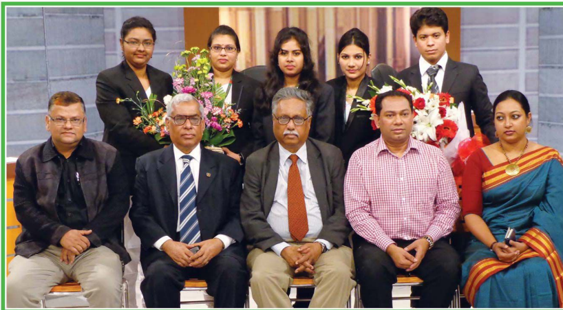
The debaters in a photo session with the chief guest and others at the national parliament debate competition at ATN Bangla

Prime University students are moving forward rapidly to face the twenty first century challenges and proving their capabilities in every aspect of their life through academic and extracurricular activities. Prime University Debate Team as a part of its glorious journey encountered Asian University of Bangladesh in the Quarter Final of the prestigious National Parliamentary Debate Competition 'Student Parliament' on ATN Bangla and achieved a thumping victory over them.