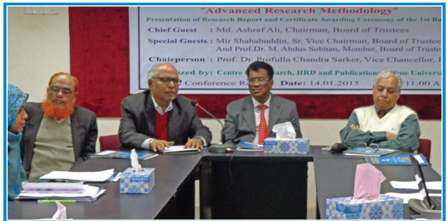
Sr. Vice Chairman and Member BOT, Vice Chancellor, Treasurer sitting on the dais at the certificate awarding program on 14.1.2015

the end of the presentation the participants were awarded with certificates.