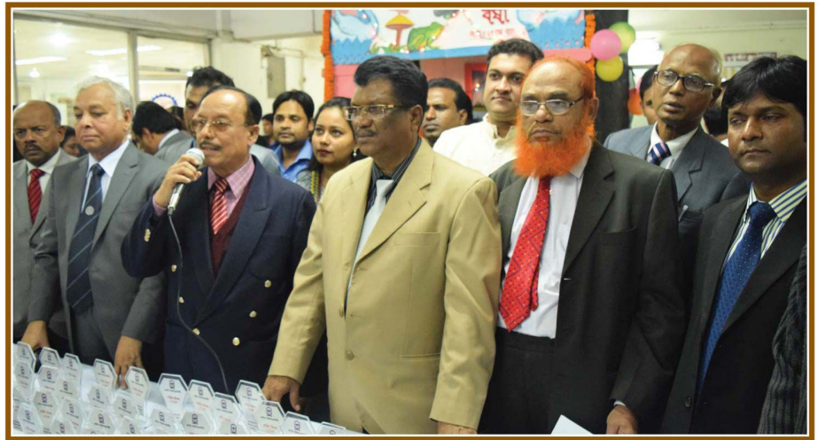
The Chairman and Sr. Vice Chairman, BOT, Vice Chancellor, Treasurer, Registrar Faculty Members, Executives and students on the eve of prize giving ceremony at the pitha festival on 16.1.2015