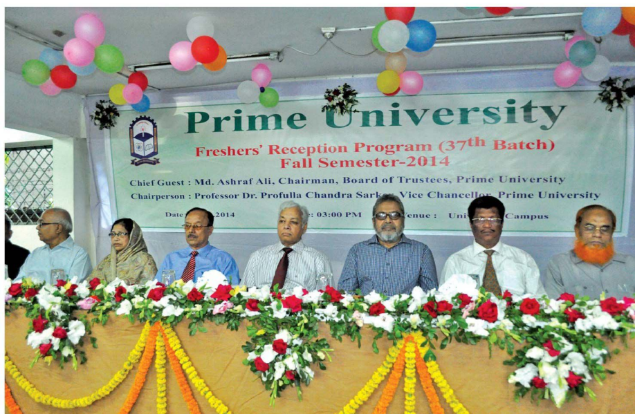
Chairman, Sr. Vice Chairman and Members of BOT, Vice Chancellor and Treasurer on the dais at the freshers' reception program on 31 October 2014

The orientation program of the newly admitted students for Fall Semester 2014 in the different graduate programs of Prime University was held at the University Campus on October 31, 2014.