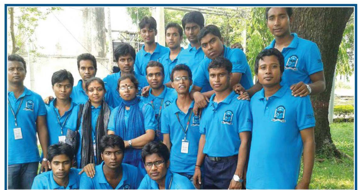
The students in front of Cox's Bazar Cable Landing Station during their study tour in December 2014

The students also visited The Cox's Bazar Cable Landing Station. (CLS) which is the sole international submarine cable landing station in Bangla-