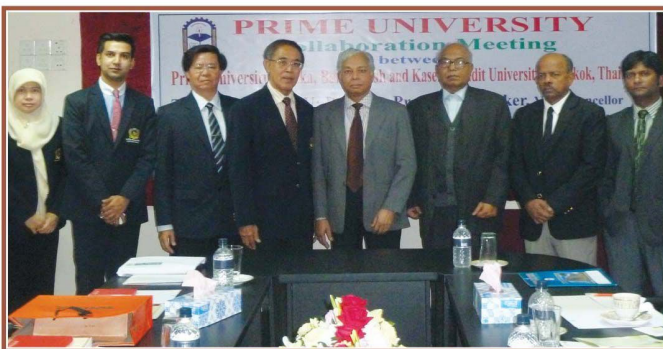
The representative team of Kasem Bundit University with Member BOT, Vice Chancellor, Registrar and Asst. Registrar, Prime University at the collaboration meeting on 25.11.2014