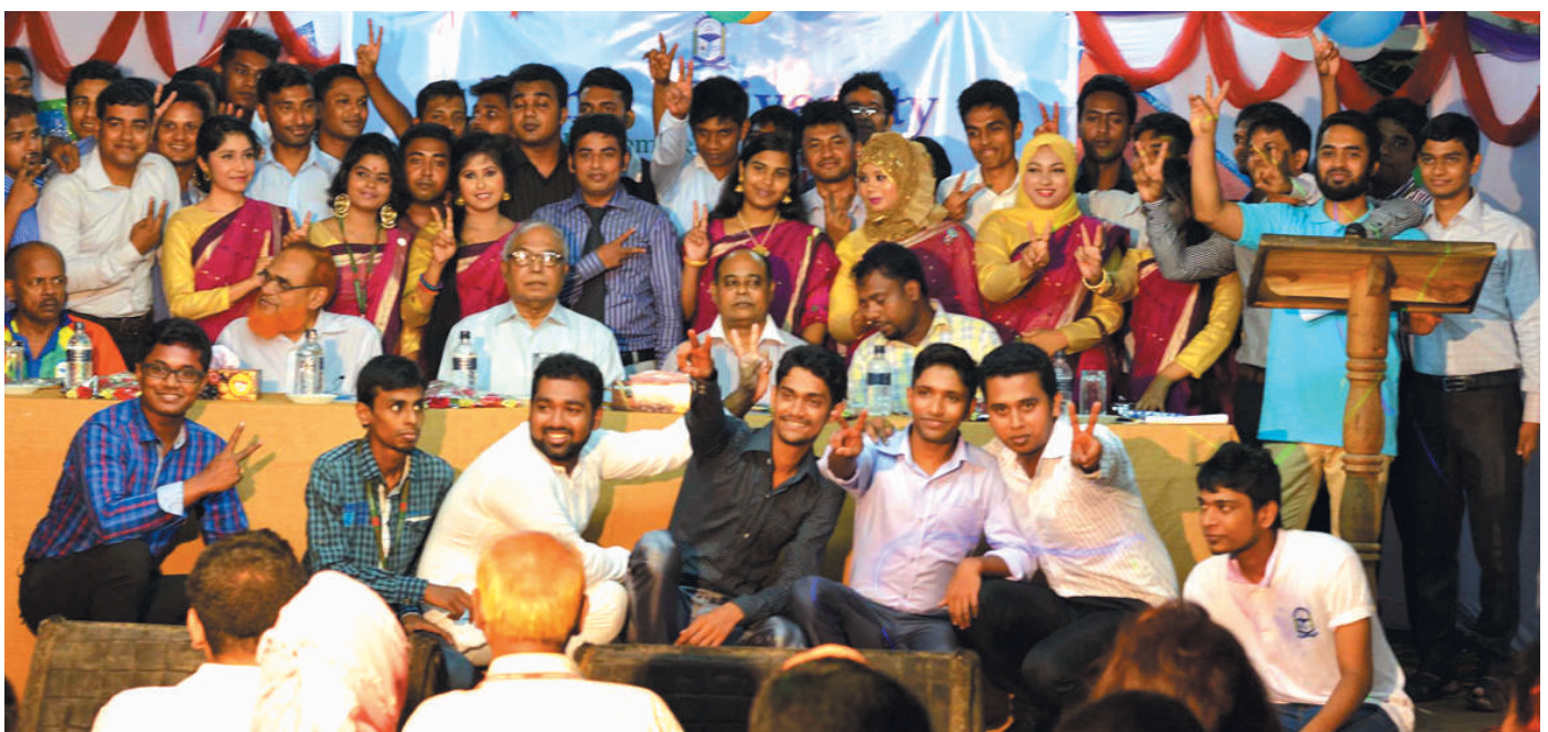
Vice Chancellor, Pro-Vice Chancellor, Treasurer, Registrar and Proctor among the students in the rag day of BBA students on 01.9.2015