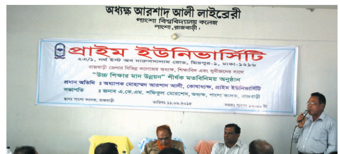
From left: Speakers addressing the audience in the discussion programs in Jhenidah on 6.6.2015 (left) and in Pangsha on 11.6.2015(right)