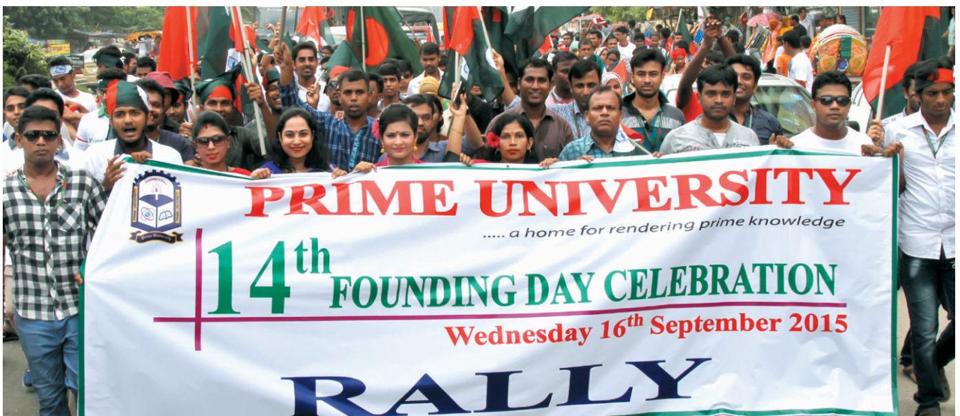
A grand rally parading the road