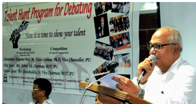
Vice Chancellor addressing the audience during the Talent Hunt program on 10.8.2015

Prime University has a great fame in the arena of debate. The debaters of Prime University have brought glories for the university from the very inception. Recently Prime University Debate and Quiz Competition Committee and Prime University Debating Society have jointly organized "Talent Hunt Program for Debating" in an aim to give the students the stage to show their potentials in debating. The whole program was segmented into three different parts as workshop, debate competition and prize giving ceremony. Students' participation was really surprising as almost one hundred and fifty students of various departments completed their registration to attend the program and show their talents. The