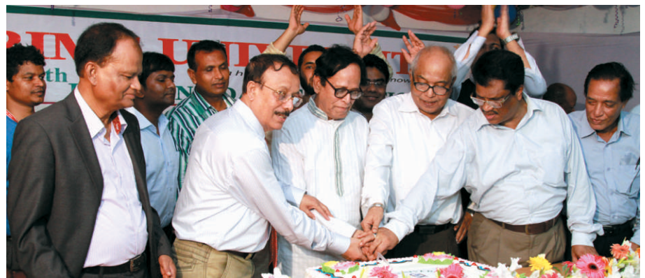
Some special moments of the occasion of the Founding Day on 16 th September 2015: Top: National flag and Prime University flag are being hoisted by the Chairman and Sr. Vice Chairmen, BOT respectively; Middle: Chief guest along with others sitting on the dais; Bottom: Cake is being cut to celebrate the day.