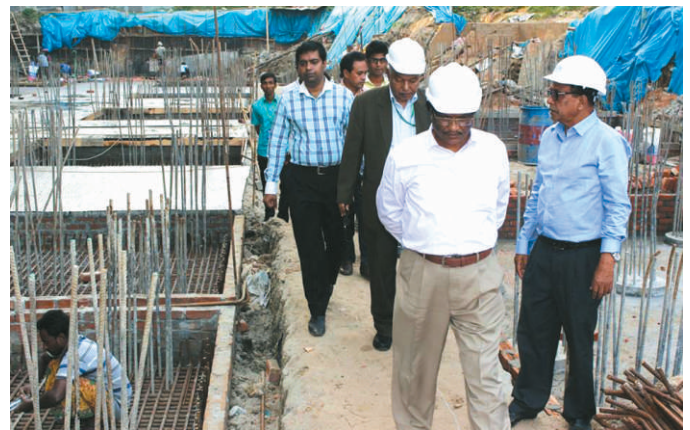
Prospective Building of Prime University (left); Senior Vice Chairman, BOT and Vice Chancellor visiting the construction site (right)