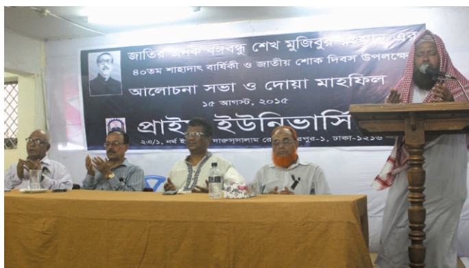
A view of Doa Mahfil for Bangabandhu on the National Mourning Day 2015

Prime University observed Father of the Nation Bangabandhu Sheikh Mujibur Rahman's 40 th death anniversary and National Mourning Day with due solemnity on 15 th August 2015. The University organized a number of programmes including hoisting black flags, holding discussions, milad mahfil and offering special prayers to commemorate the great leader and his family members who were killed on August 15 in 1975. Vice Chancellor, Pro-Vice Chancellor, Treasurer, Registrar, teachers, officials and