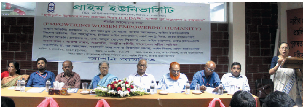
A speaker of Bangladesh Mahila Parishad addressing the audience on 2.9.2015