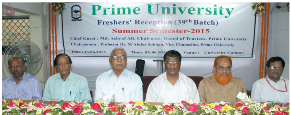
Sr. Vice Chairman and Member BOT, Vice Chancellor, Treasurer, Dean and Registrar sitting on the dais on the freshers' reception program on 15.6.2015