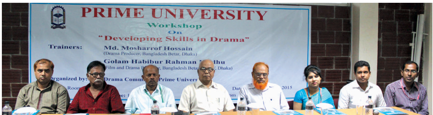
Trainers, guests and organizers sitting on the dais at the inauguration of the workshop on 07.6.2015

About 60 participants successfully completed their training with great satisfaction. The workshop program was concluded on June 10, 2015. The successful participants will be awarded certificates.