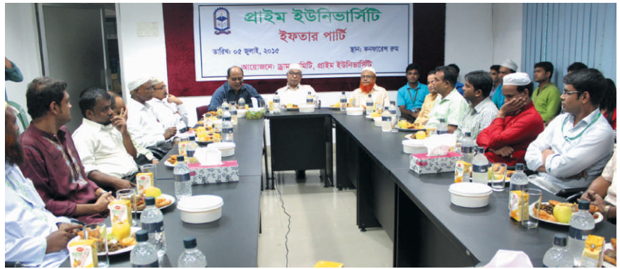
Vice Chancellor, Pro-Vice Chancellor with others at the iftar organized by drama club on 05.7.2015

administration arranged a central Iftar Party on July 13, 2015 at the ground floor of the campus. Prime University Drama Club also arranged an Iftar party on July 5, 2015 at the conference room of the campus. In the Iftar parties Doas and Munajats were offered seeking forgiveness of the Almighty Allah and future prosperity of the Prime University and the country.