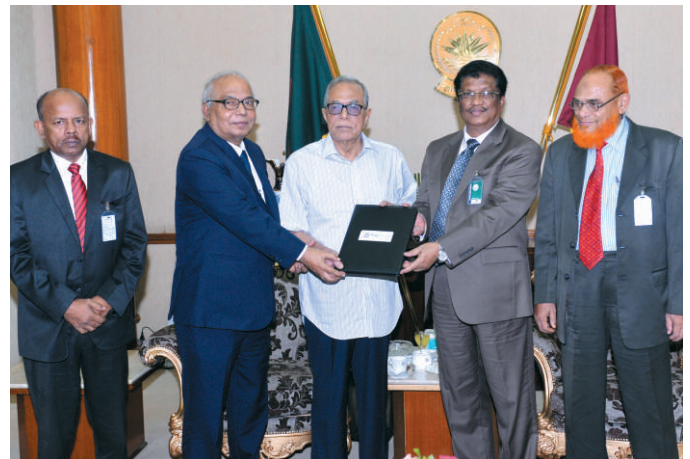
A four member delegation of Prime University with the hon'ble President Md. Abdul Hamid on 22.9.2015