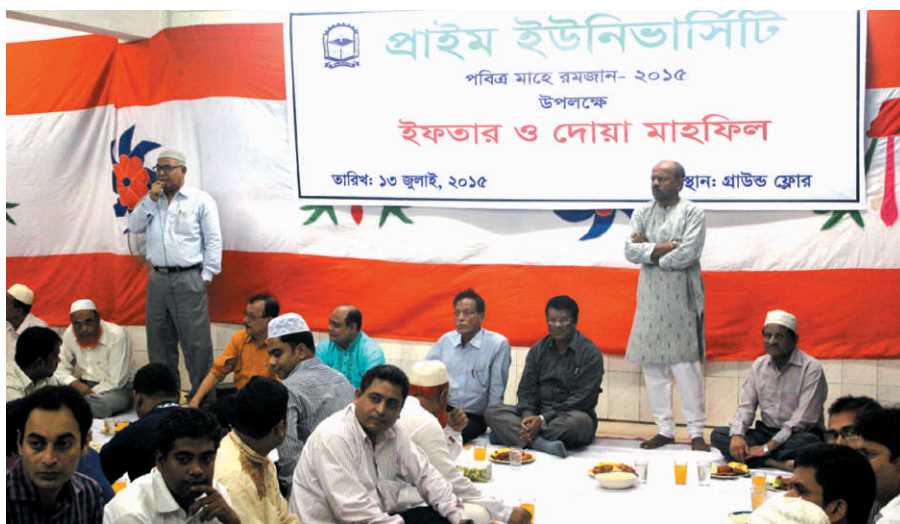
Vice Chancellor addressing at the iftar and Doa Mahfil on 13.7.2015

deeds, thoughts and words. Iftar is one of the significant rituals of the holy Ramadan. Iftar at the sunset gives enormous pleasure and heavenly gratification to the fasting Muslims. That is why, Iftar party is considered as a vital tradition in the month. In the holy month of Ramadan this year like every precious year, different departments of Prime University e.g. English, Law, Business Administration, Computer Science & Engineering, Electronics & Telecommunication Engineering, and Electronic & Electrical Engineering organized Iftar parties with great festivity in a befitting manner. Besides, Prime University