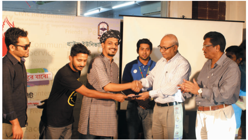
Sr. Vice Chairman, BOT and Vice Chancellor are seen during the program 'Projonmo Agami' on 29.6.2015

Second day, again Expressions Ltd. and media partner Channel i and Radio Today organized the