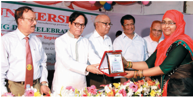
A student receiving award from the chief guest (left) and a stage performance (right)