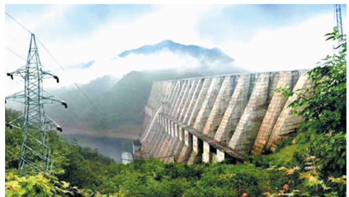
Kaptai Power Plant

At its commission in 1962, the plant capacity was 80 MW of electricity. In later years, the generation