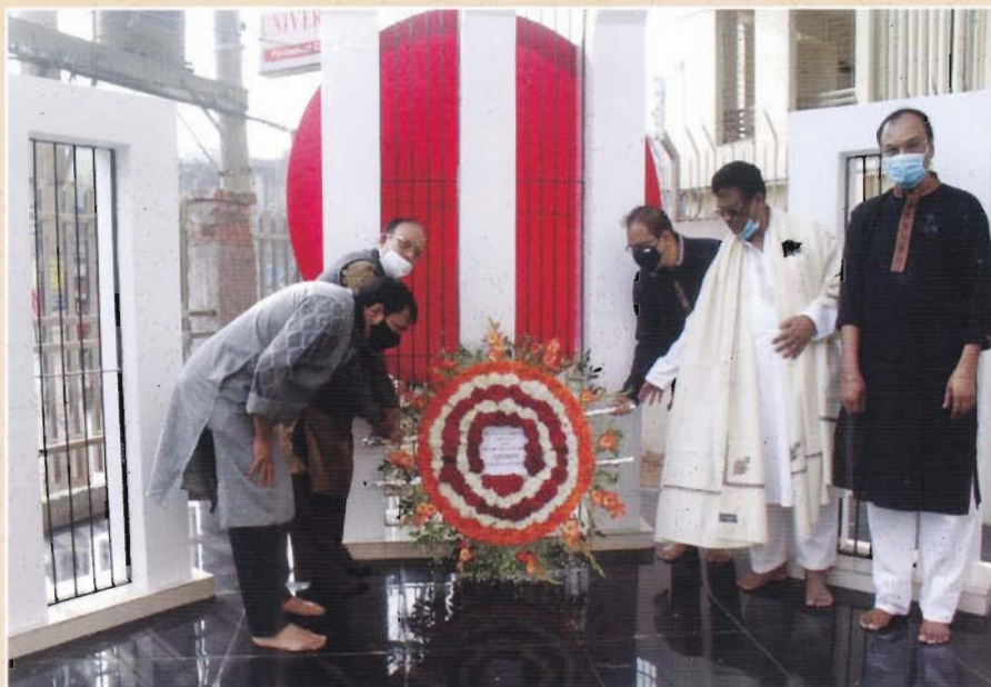
A view of paying the floral wreath by the members of Board of Trustees and the Vice Chancellor