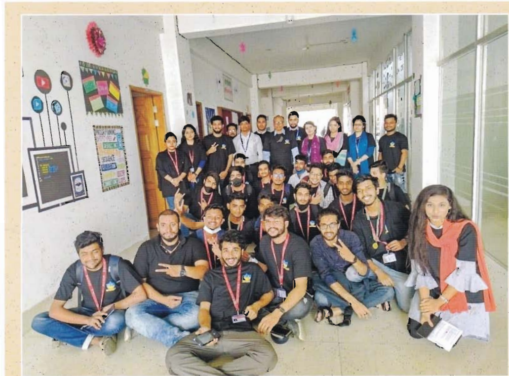
The participants of the programming contest along with the faculty members of the Department