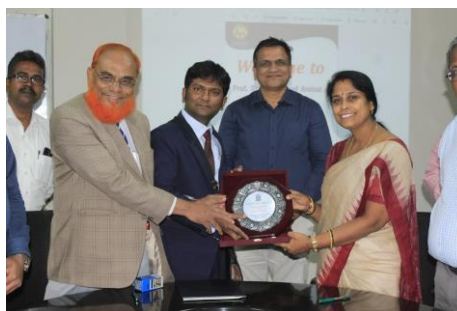
MoU with Integral University