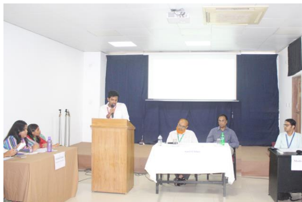
A debator presenting his speech

Law became the first runner-up and the second runner-up respectively in this competition. The grand finale and all the debate sessions were attended by the respected Chairman, Senior Vice Chairman of BoT, Treasurer, Deans of Engineering Faculty and Business Studies, Registrar, Controller of Examinations, Heads and faculty members of different departments.