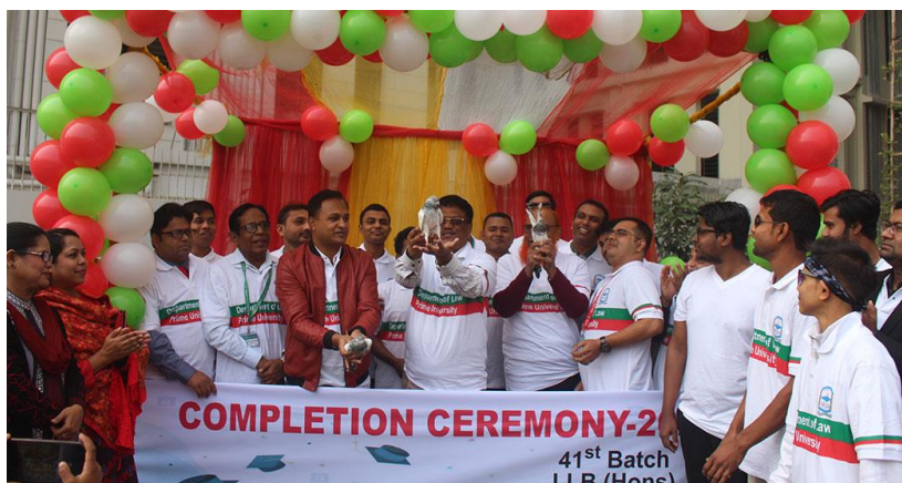
Pigeons being released during the opening ceremony of the course completion program