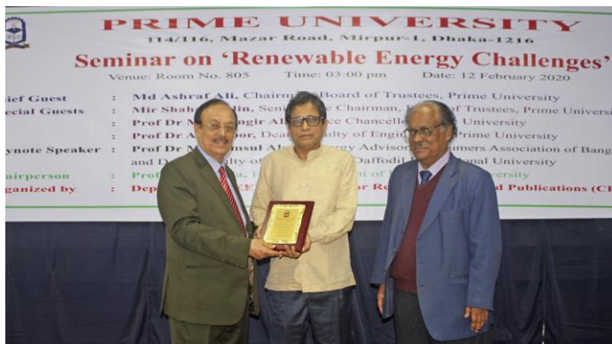
The speaker of the seminar receiving crest from the Chairman, BoT