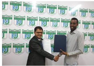
MoU with Hormuud University