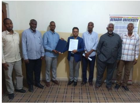
MoU with Benadir University