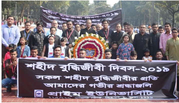
Dean, Faculty of Business Studies along with others on their way to pay homage to the martyrs