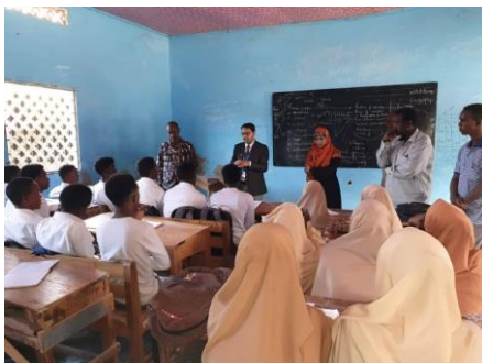
Dugsiga Hoyga Xamar Primary and Secondary School