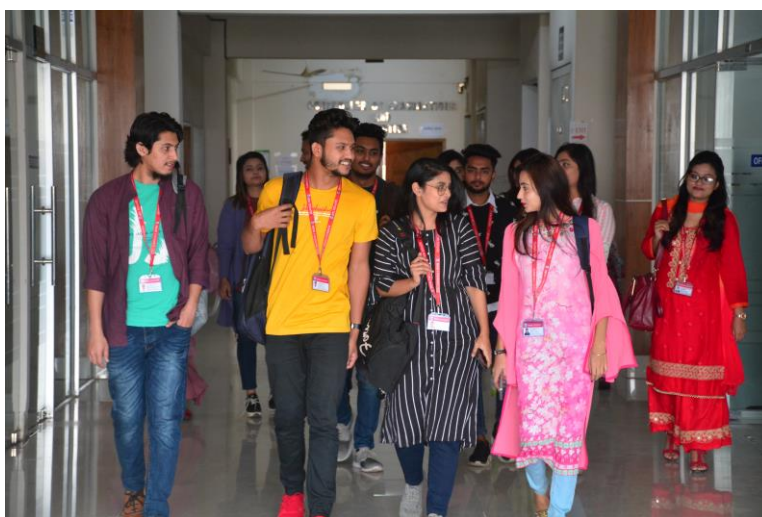
Students inside the permanent campus