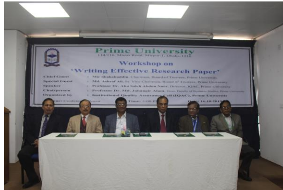
Workshop on ‘Writing Effective Research Paper’