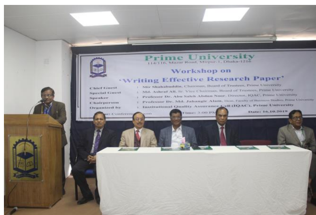
The Director of IQAC delivering speech