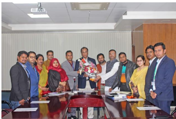
The new President of PUAA is being welcomed with flower bouquet