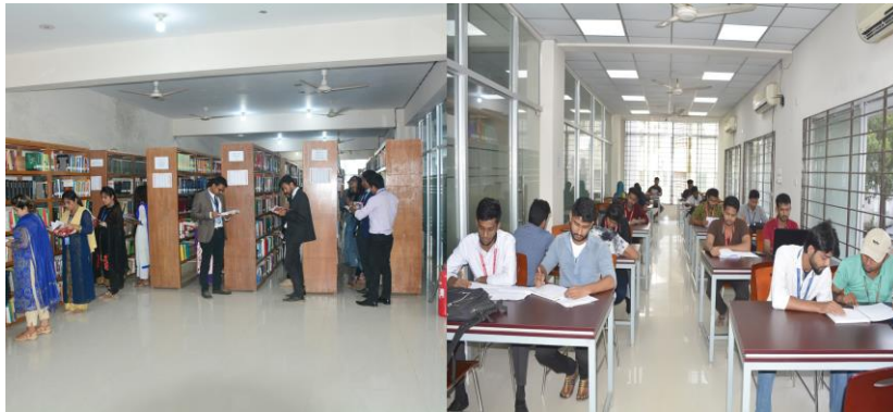
Students studying at Prime University Library

Library is an important organ of higher educational institutions and usually serves two complementary purposes: (1) to provide the support service for the study of the course curricula and (2) to support the faculty members and students on research and development activities. A library is regarded as the