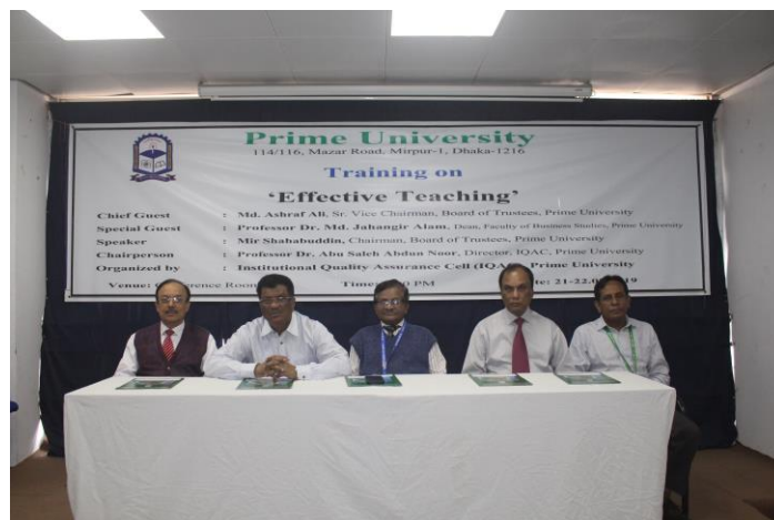
Training on ‘Effective Teaching’