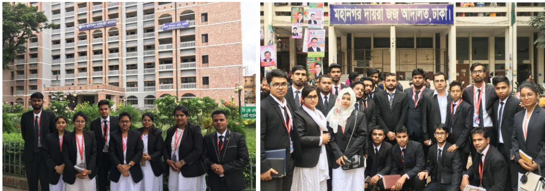
Students of the 44 th batch (left) and the 45 th batch (right) during their court visit