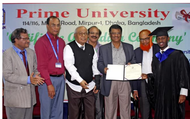
A foreign student receiving certificate from the Chairman, BoT