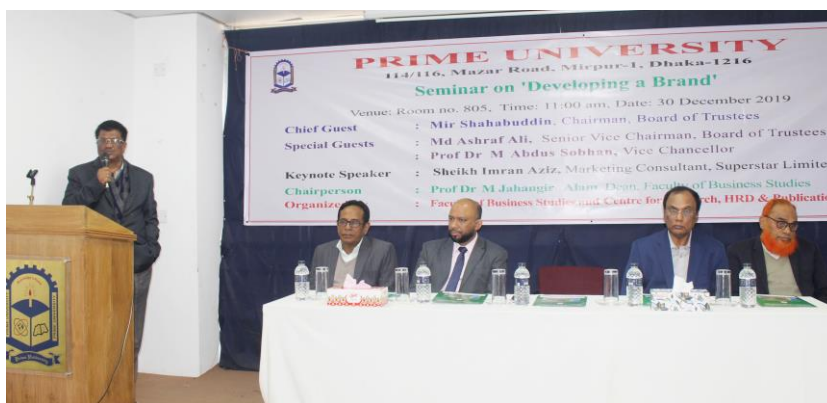
The Chairman, BoT delivering speech during the inaugural session of the seminar