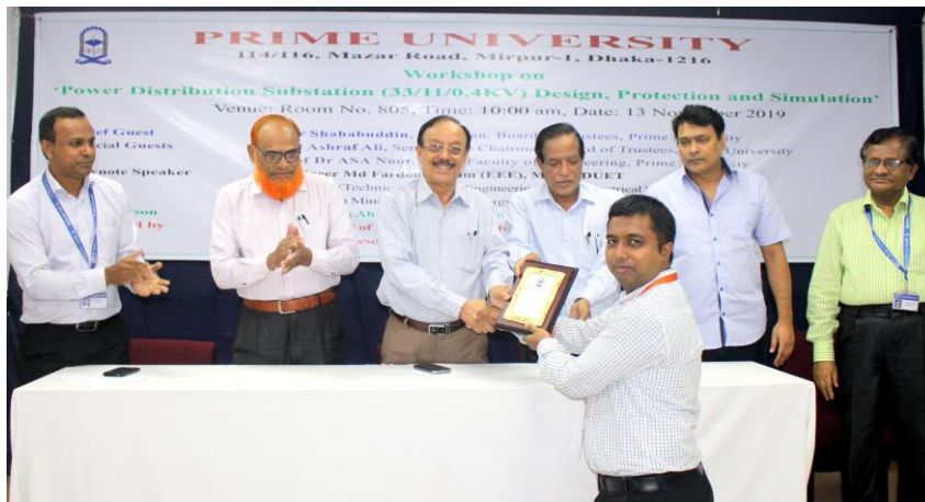
A participant receiving crest from the Senior Vice Chairman, BoT