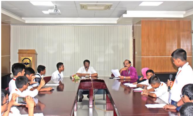
A student asking question during the interview session

after the Liberation War and 15 th August 1975: National Mourning Day. Moreover, they wanted to know the experiences and feelings of the Freedom Fighters during the Liberation War about Mass atrocities of Al-Badar and Razakar forces.