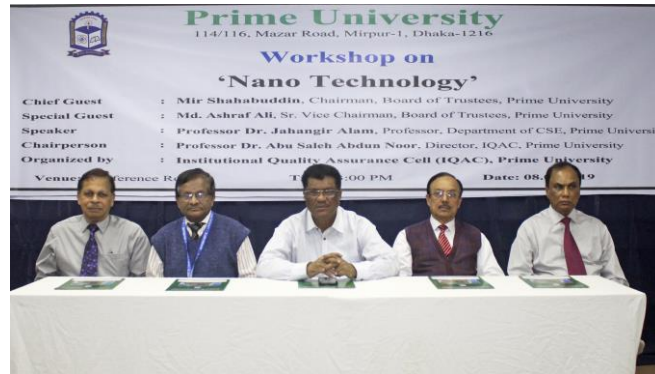
Workshop on ‘Nano Technology’