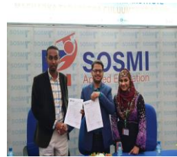
MoU with The Somali Science Mentorship Institute