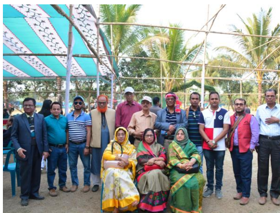
A memorable view of the picnic