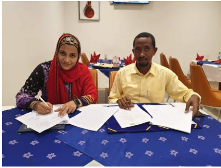
MoU with Darul Hikmah