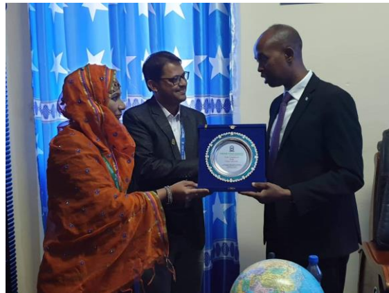
PU team handing over a crest to Hon'ble Minister of Labor and Social Affairs of Federal Government of Somalia, Sadiq Warfa