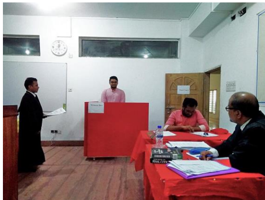
A view of the Mock Trial by the students of 40 th batch, Department of Law

With a view to building up the credible legal skills of the students, the Department organized a mock trial (a simulation of real trial) for the students of