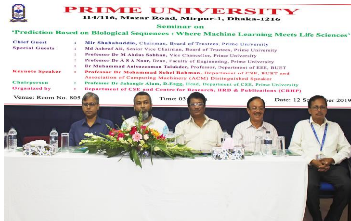
The Chairperson, guests and the speaker sitting at the dais during the seminar

Organized by : Centre for Research, HRD and Publications and Department of Computer Science & Engineering