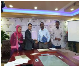
MoU with Mogadishu University