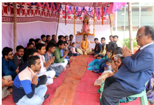
Devotees performing the Saraswati Puja-2020

Saraswati Puja was celebrated with great enthusiasm at Prime University premises on 15 Magh, 1426 Bangla and 30 January (Thursday) 2020. Devotees, teachers and students entered the pandal seeking the blessing of the goddess of learning. Around fifty devotees celebrated the Saraswati Puja by setting up colorful mandap and placing the idol of the goddess with different types of sweetmeats, fruits and other items and articles of handicrafts. The rituals started at 8:30 am with the establishment of Pratima. The celebration also included Devi Aradhona, Pushpanjoli, distribution of prashad and ceremonial immersion of Devi idol with priests chanting mantras and devotees placing palash flowers at the Deity's feet with the sounds of cymbal and conch shell.