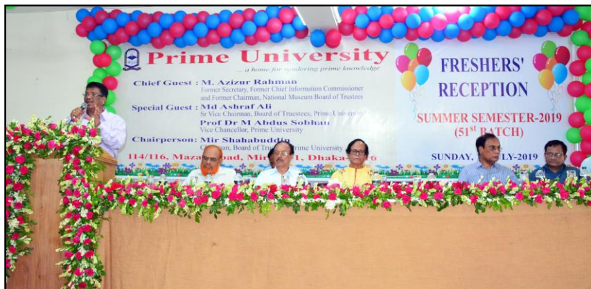
Views of the reception programs