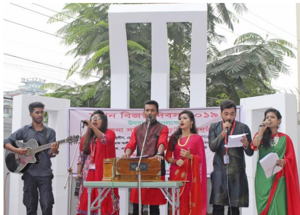
Students presenting patriotic song during the program