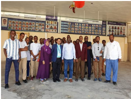
Visiting Moasser Primary and Secondary School