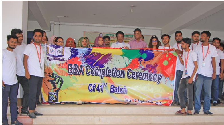
A view of the completion ceremony