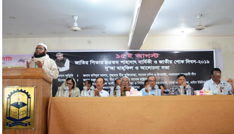
Special prayer is being offered for eternal peace of the Father of the Nation