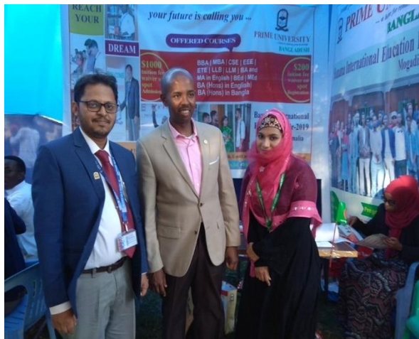
Hon'ble minister of Labor and Social Affairs of Federal Government of Somalia, Mr Sadik Warfa visited the stall of PU of International Education Fair

PU team participated in a two-day International Education Fair–2019 in Somalia organized by Banana Group and supported by the Ministry of Education, Culture and Higher Education Somalia. Like PU, several other local and foreign universities such as Mogadishu University, Somalia, Red Sea University, Sudan, University of Southern Somalia, Jomo Kenyatta University of Agriculture and Technology, Nairobi, Kenya, Metropolitan University of Somalia, Mogadishu City College, Green Hope University, Mogadishu, University of Somalia, Golden University, Mogadishu, Marwa Women's University, Mogadishu, Lincoln University College, Malaysia participated in the fair. The purpose of organizing such fair was to offer an ideal platform to all the stakeholders who were involved in higher education sector namely educational institutions, consultancy firm – Banana Group, students, guardians,