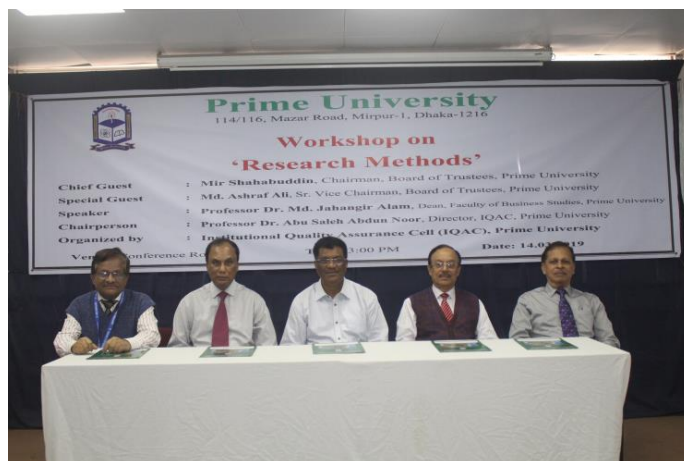
Workshop on ‘Research Methods’