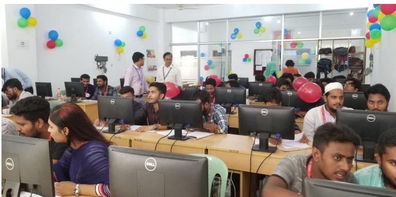
A view of the software laboratory on CSE day-2019