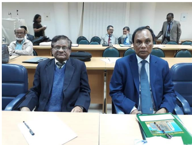
The Vice Chancellor and the Director, IQAC at the workshop on ‘Status of the IQACs at Private Universities: Ways to Step Forward’

the various ways adapted by different private universities for ensuring the culture of quality education.