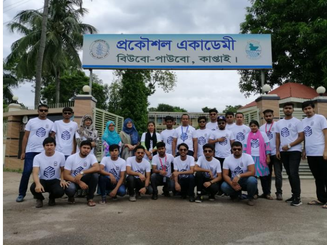
Students and the Faculty Members during the power plant visit

During the inspection, the students were briefed regarding the first feasibility study for setting up a hydroelectric power plant located at Kaptai in Bangladesh. It is the only hydroelectric power plant which was started in 1908 in the country. Kaptai Dam was constructed in Kaptai upazila under the district of Rangamati with a dam on the river Karnafuli. The center started its journey in 1982 with two units of 48 MW each. Later, three more 50 MW units were set up. Unit number three was added in 1982, and units number 4 and 5 were established in 1986. The first three of these are set in U.S. technology. The next two were set up by Tokyo Electric Power Services Company (TEPSCO) of Japan. At the time of installation of these two, ancillary facilities were left for setting up of two more units. It was the Japanese company that explored the possibility of generating more electricity there in 1997. At present there are five units in operation with a total power generation capacity of 230 MW. The students were fortunate to witness the process through which a hydroelectric power plant works.