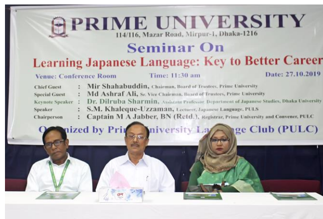
From left: the Chairperson, special guest and the keynote speaker of the