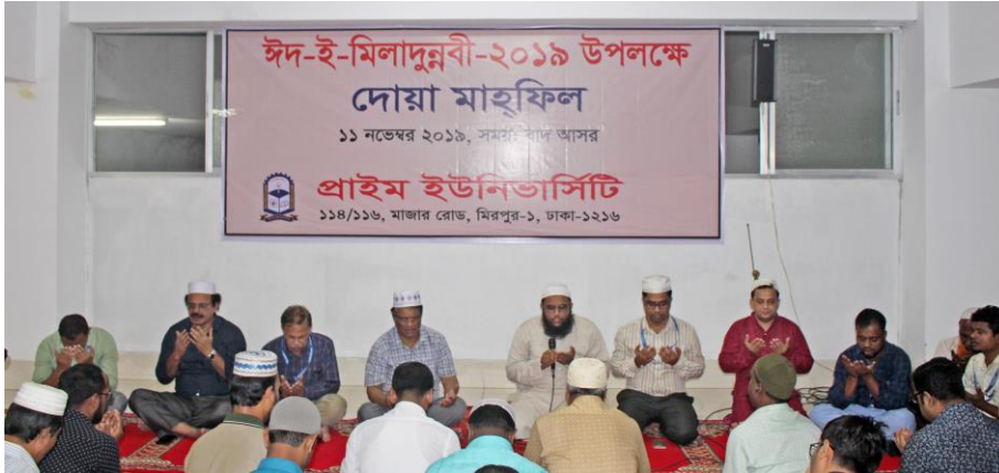
Participants seeking blessings during the milad and doa mahfil