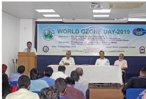
The Chairman of the seminar delivering speech