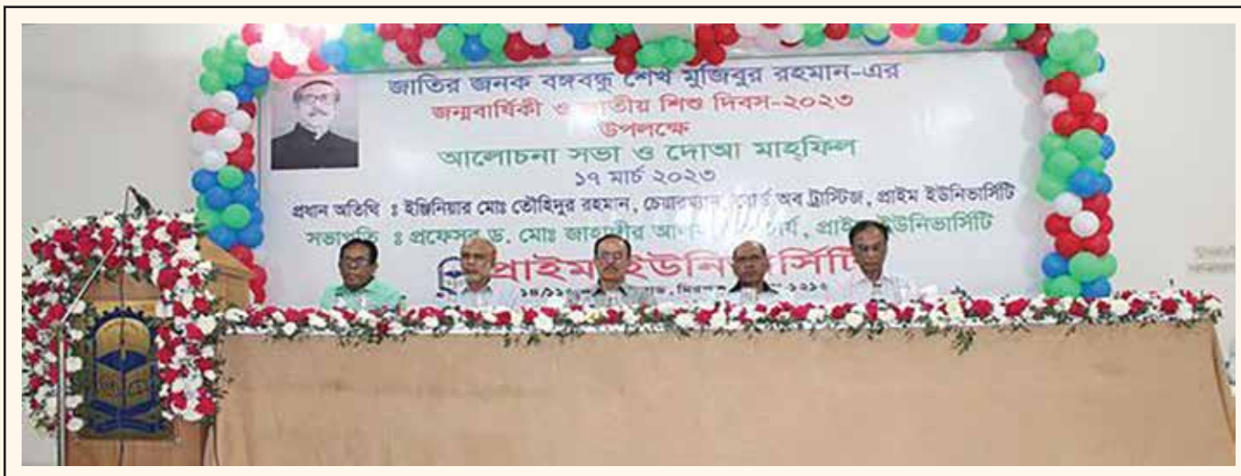
A moment of reverence and inspiration: celebrating Bangabandhu Sheikh Mujibur Rahman's 103 rd Birthday and National Children's Day at Prime University