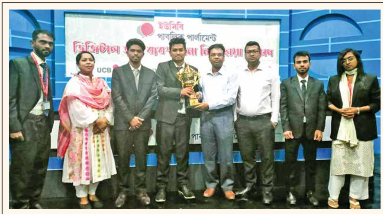
Participants and faculty members in the demo parliamentary debate Competition 2023 at BFDC Auditorium with runner-up trophy

Department of Law, Prime University participated in a demo parliamentary debate competition 2023 organized by the Debate for Democracy (DFD) held on April 02, 2023 at Bangladesh Film Development Corporation (BFDC) auditorium. On that very day Green University of Bangladesh played as the ruling party in parliament and the