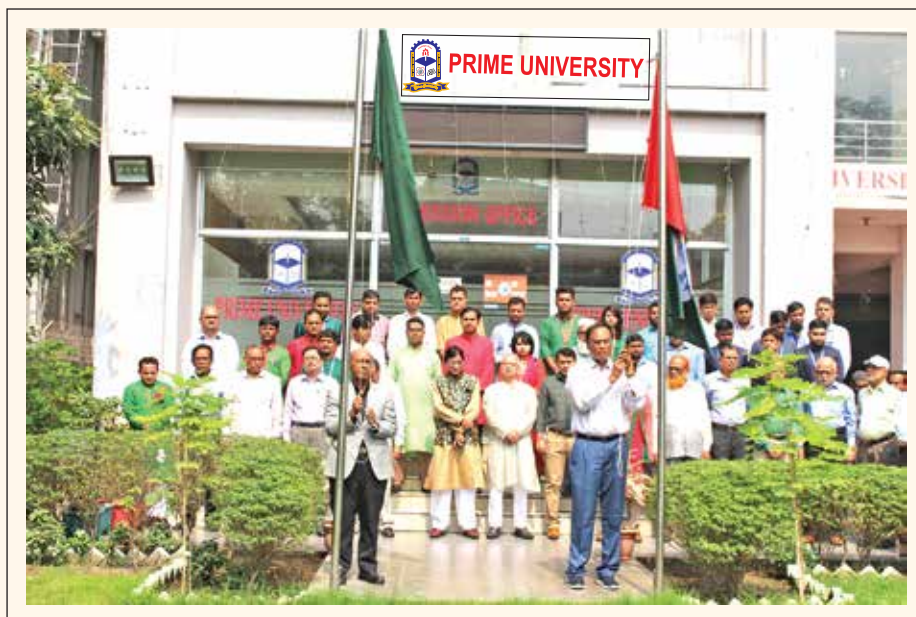
Flags hoisting by the Chairman, Board of Trustees and the Vice-Chancellor of the University