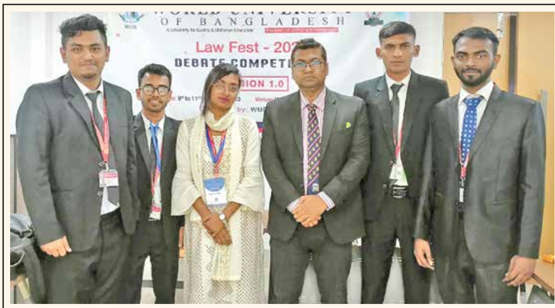
Participants with mentor at the Law Fest event at the Debate Auditorium of World University of Bangladesh