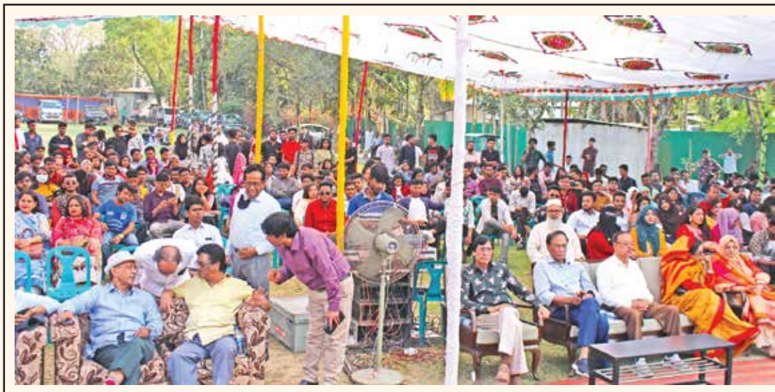
Prime University's Annual Picnic 2023

Prime University's yearly picnic of 2023 provided a cherished opportunity for students, teachers, and alumni to bond outside the academic setting. It fostered a sense of unity, allowing everyone to forge lasting connections and to create beautiful memories together.