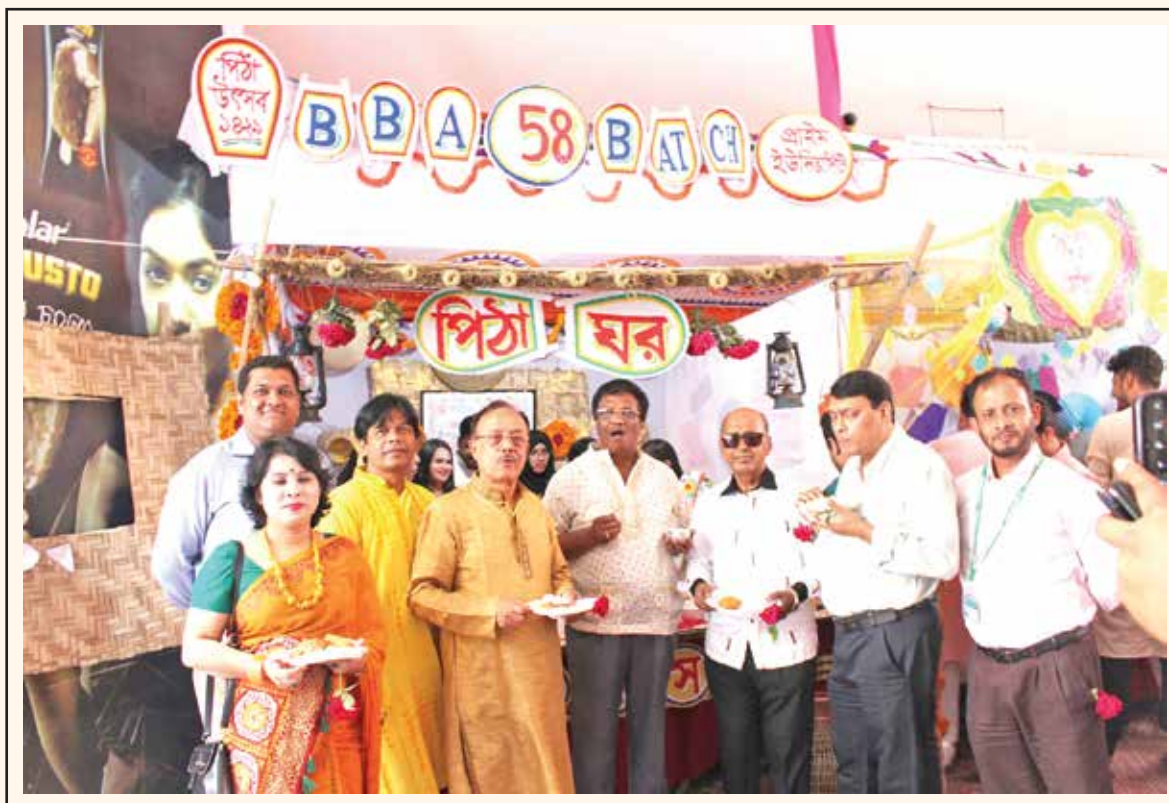
The Chairman and Members, BOT along with others enjoying pitha in front of a stall

Bhapa, Rosh Khejur Finni, Bhajapuli, Kola Pitha, Pati Shapta, Nakshi Pitha, Jhinuk Pitha, Puli Pitha, Dudh Chitai and Hriday Haran were the main attractions in the festival. The judges selected the 1 st , 2 nd and 3 rd stalls considering the excellent decoration, handsome items of pitha and utmost management.