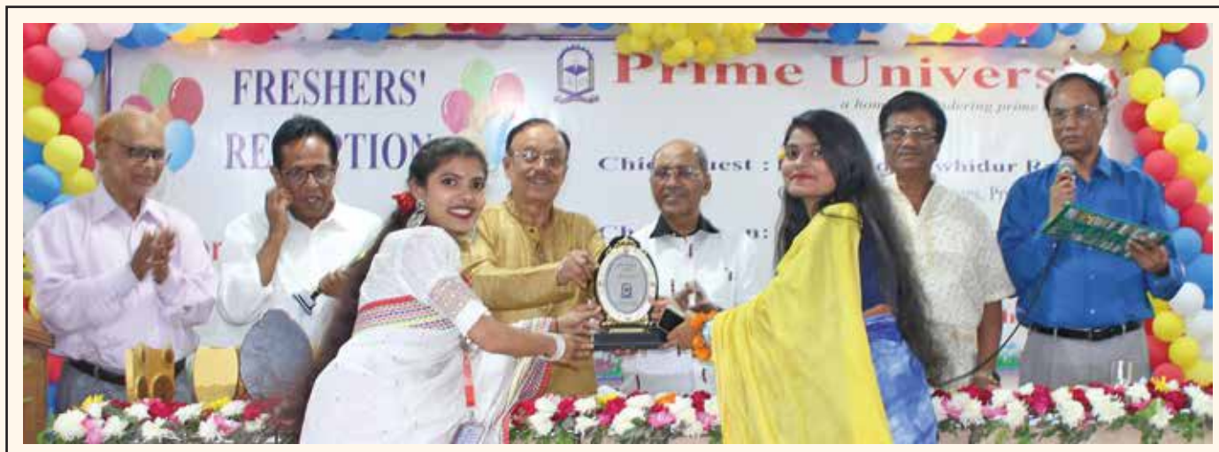
Honorable guests handing over the crest to the champions at freshers' reception ceremony

To conclude the event, an engaging cultural program was organized by Prime University Cultural Club with the students of Prime University. Before that, the guests distributed crests and certificates to the awarded students of the Annual Cultural Competition and Pitha Utshab 2023 of Prime University.